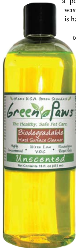
ABOVE: GREEN PAWS PET SAFE HOUSEHOLD CLEANER MEETS USA GREEN STANDARD AND IS COMPLETELY BIODEGRADABLE. USING ELECTROLYTES TO REPEL SOIL, THIS PRODUCT WORKS WELL ON ALL SURFACES AND DOES NOT CONTAIN HARMFUL INGREDIENTS. WWW.GREENPAWSDIRECT.COM .

Each year an astounding 10 millions tons of pet waste ends up in our nation's landfills. For the eco-conscious dog owner, biodegradable waste bags minimize landfill waste by allowing the bag and its contents to decompose. Waste composters are also becoming a popular alternative, turning waste into an odor-free liquid that is harmless to lawns.