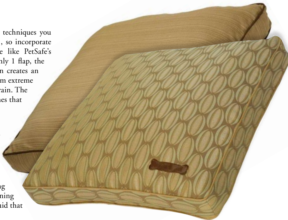
ABOVE: JAX AND BONES ECO BAMBOO BEDS ARE MADE WITH SUSTAINABLE FABRICS AND YARNS AND FREE OF CHEMICALS. MADE FROM RECYCLABLE MATERIALS, THE BED INSERT IS FILLED WITH A FIBER MADE FROM POST CONSUMER PLASTIC BOTTLES. WWW.REDDOGHOUSE.COM .

If your pet makes a mess, use a chemical-free product to eliminate the odor. Dr. Stink's Odorzout ( www.88stink.com ) is EPA approved and free of perfumes, chemicals, and additives. Safe for you and your pets, Odorzout completely eliminates odors from pets, stains, and cat litter boxes without sacrificing your pet or the planet.