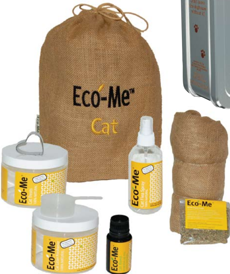
LEFT: ECO-ME'S CAT KIT IS A PERFECT WAY TO START YOUR GREEN MAKEOVER. EACH KIT COMES WITH NATURAL LITTER FRESHENER, ORGANIC RECIPES, NATURAL FLEA REPELLANT, AND ORGANIC CATNIP. ECO-ME HAS A KIT FOR DOGS, AS WELL AS EVERY OTHER MEMBER OF YOUR FAMILY. WWW.ECO-ME.COM.

of greenhouse gas emissions and a single dog is responsible for 1.75 tonnes per year? With over 88.3 million cats and 74.8 million dogs nationwide, it's time we become cognizant of our pet's carbon paw print.