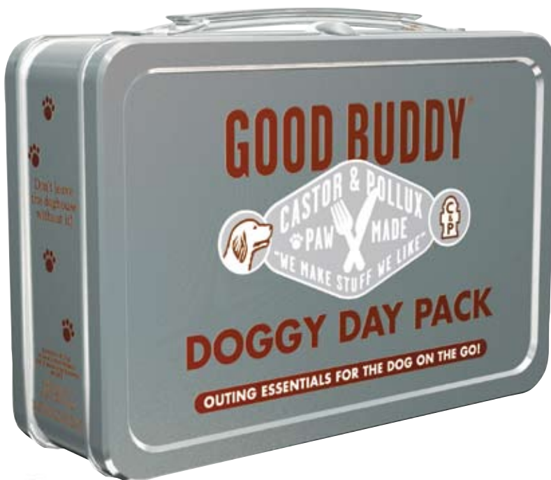
ABOVE: CASTOR & POLLUX MAKES IT EASY TO GO GREEN WITH ITS GOOD BUDDY DOGGY DAY PACK. A GREAT GIFT, EACH PACK IS LOADED WITH ECO-FRIENDLY ESSENTIALS LIKE BIO DEGRADABLE WASTE BAGS, ORGANIX FOOD, AND A FUN TOY, FOR A VACATION OR TRIP TO THE PARK. WWW.CASTORPOLLUXPET.COM.

If you're like most home-owners in the country there are four furry paws in your family that you may not have considered in your quest to go green. Did you know that a single cat is responsible for almost half a tonne